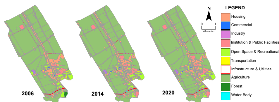
Figure 2: Land use changes in Guar Cempedak 2006, 2014 and 2020