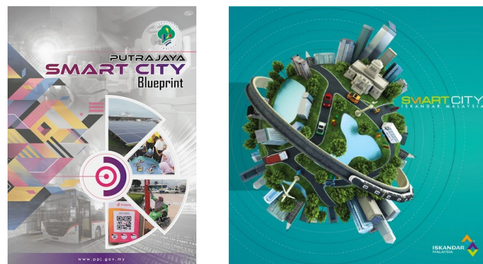
Figure 1: Putrajaya Smart City Blueprint (Left) and Smart City Iskandar Malaysia Framework (Right)

Kuala Lumpur City Center. Nowadays, this city houses various government offices that were relocated from Kuala Lumpur previously. 37% of Putrajaya is dedicated to parks and open spaces. There are 200 hectares of man-made wetland and a 400-hectare man-made lake, allowing for the creation of 38 kilometres of waterfront within 5,000 hectares of total land area (Figure 2).