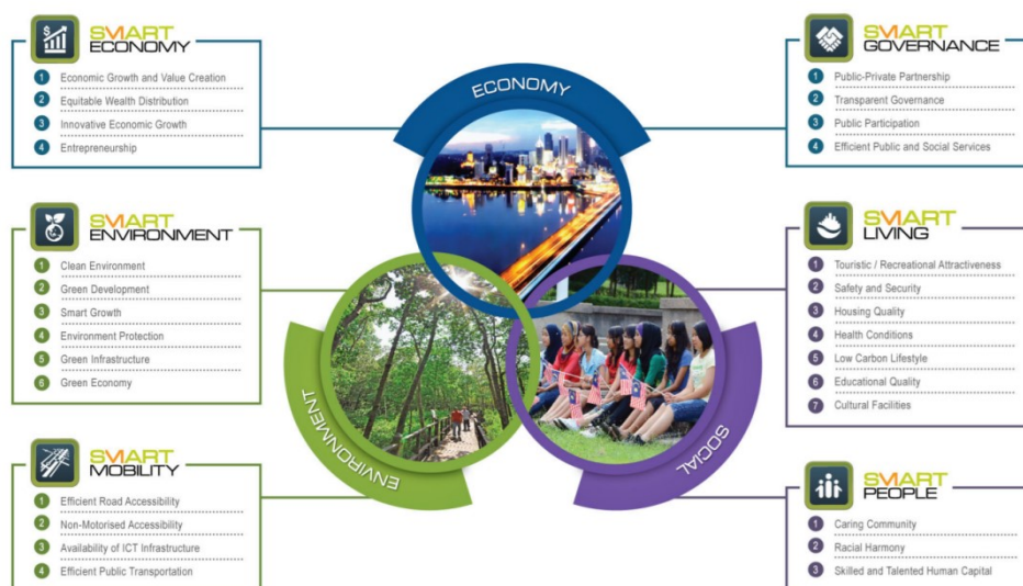
Figure 3: Smart City Iskandar Malaysia Framework

The total size of Iskandar Puteri is only 4% of Iskandar Malaysia's regional development area, but now it is one of the nation's most-recognised developments. Since Smart City Iskandar Malaysia Framework was introduced in 2012, it has become an added-value-enabler initiative to provide ease of doing business and improve the quality of community living in Iskandar Malaysia. There are six (6) Dimensions listed under three (3) focus areas (Economy, Environment and Social) with 28 Characteristics introduced (Figure 3):