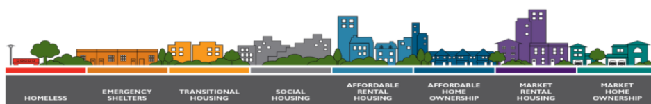
Figure 2: The Housing Continuum in Canada

The Canadian government decided to unveil their first National Housing Strategy (NHS) in 2017 to address the country's housing affordability and affordable housing throughout the country. In order to address all affordability issues in each segment of housing, the housing continuum was created. Housing continuums have long been incorporated into national housing policy and have been implemented in other Canadian provinces, but in 2018, CMHC established a new housing continuum (Julia, 2018), as shown in Figure 2.