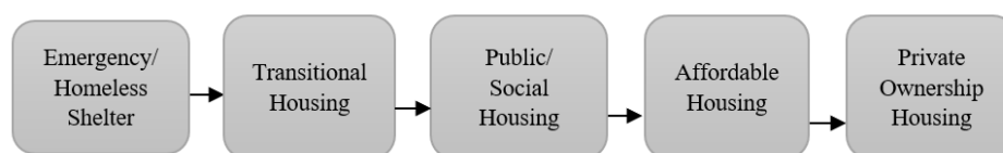
Figure 5: Preliminary HCM of GKL

Therefore, this research proposes the HCM (please see Figure 5), which outlines a preliminary housing continuum framework for GKL. The proposed HCM begins with basic shelter for the homeless and ends with private housing built by private developers. Private housing is typically pricier than the government-developed public housing targeted at lower- to middle-income buyers.