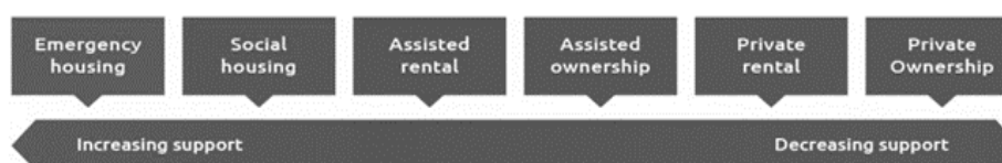
Figure 3: The Housing Continuum in New Zealand

strong focus on ensuring that Aucklanders have security of tenure, as renting is becoming a long-term, possibly permanent, reality for many households. The continuum will foster both security of tenure and pathways to greater independence by offering housing choice and social mobility (Auckland Council, 2020).