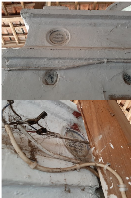
Figure 2: Ancient ceramics become a unique decoration in the grave complex of Sunan Gunungjati which is indicated to be damaged

The outcomes of the study demonstrate that the cover space in Astana Village's heritage area changed from 2006 to 2020. The results of the mapping show changes (see Figure 3). Since ancient times, mapping has been extremely beneficial for administrative, navigational, cultural, and other purposes (Hossain & Barata, 2019). Built-up land cover and the expansion of road networks are shown to cause changes in the mapping. The morphological circumstances of earlier use, whether agricultural land or the way it was used, often shape settlements (Dovey et al., 2020) should be able to communicate with one other. The road network development map enables access in the expanded land cover region, virtually completely surrounding the graveyard complex. Every seven years, there are huge changes in space.