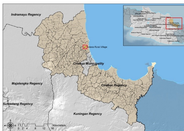
Figure 1: The Position and Location of Research Area

Astana Village is located in Gunung Jati District, Cirebon Regency. Cirebon Regency is located in the eastern part of West Java Province. With a geographical location of 108°33 East Longitude and 6°41 South Latitude (see Figure 1). The research location is located in the heritage area according to the regional regulations of Cirebon Regency. Sunan Gunungjati, a member of a walisanga (Islamic preacher) and the King of the Cirebon Sultanate, uses the research area as a pilgrimage tourist attraction (Agustina et al., 2016). The condition of the artifacts in the tomb complex area will be related to changes in space in the area. The tomb complex has become a magnet for regional economic growth.