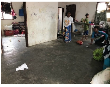
a) The indoor condition of a brick house. The bathroom was used as the storage area.

In Bongor village, the Malaysian government had built brick houses to help the Aboriginal people achieve a more comfortable and enhanced lifestyle. Brick houses may also help to protect the people from wild animal attacks because the structure is more durable.