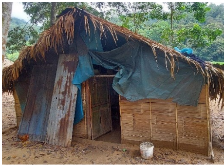
b) Canvas and zinc sheet used on the wall and roof; Dirt flooring, no floor finishes