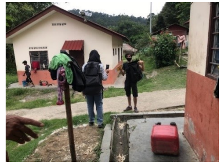
b) The outdoor condition. A few houses were unoccupied.