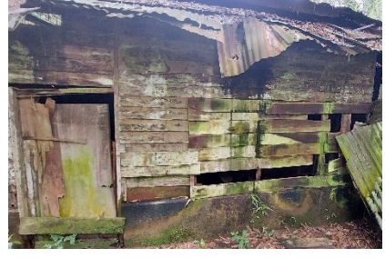
a) The condition of the decayed wooden house and surrounding bamboo homes