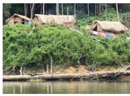
a) Tan Hain Village