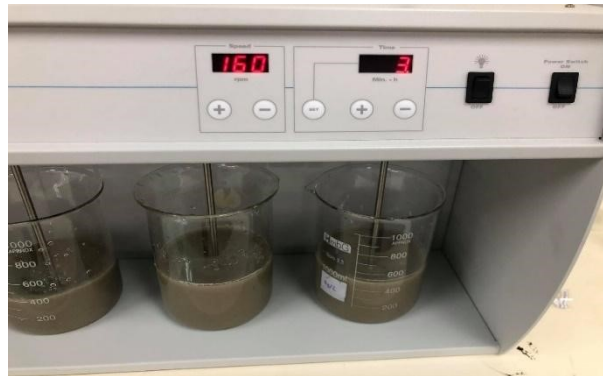
Figure 2: Jar test apparatus and setting

17 min at 40 rpm. Figure 2 demonstrates one of the settings in the Jar test. Next, water sample was collected for 60 min, 90 min, 120 min, 150 min, 180 min, and 210 min for testing and analysing the final concentration for each heavy metal. The aforementioned steps were repeated by using acid-treated and alkaline-treated fly ash.