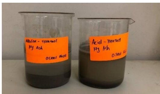
Figure 1: Fly ash soaked in HCl and NaOH

In this study, fly ash (FA) was collected from Jimah Power Plant which is located at Port Dickson, Negeri Sembilan. It was washed thoroughly with distilled water to remove the impurities and oven dried at 120 °C for 24 h. After that, the fly ash was allowed to cool at room temperature prior to being sieved to 250 µm. The fly ash was later separated into three batches, the first batch was an untreated sample and the other two batches were treated by using 0.5 mol of sodium hydroxide (NaOH) and 0.5 mol of hydrochloric acid (HCl). In the pretreatment phase, 72 g of fly ash were immersed separately in two distinct beakers containing 0.5 mol of NaOH and 0.5 mol of HCl solutions for 24 h as depicted in Figure 1. Both chemicals treated fly ash were subsequently filtered and rinsed with distilled water to eliminate the excess NaOH and HCl from the surface. The pretreated fly ash was then dried at 105 °C for 24 h for further use.