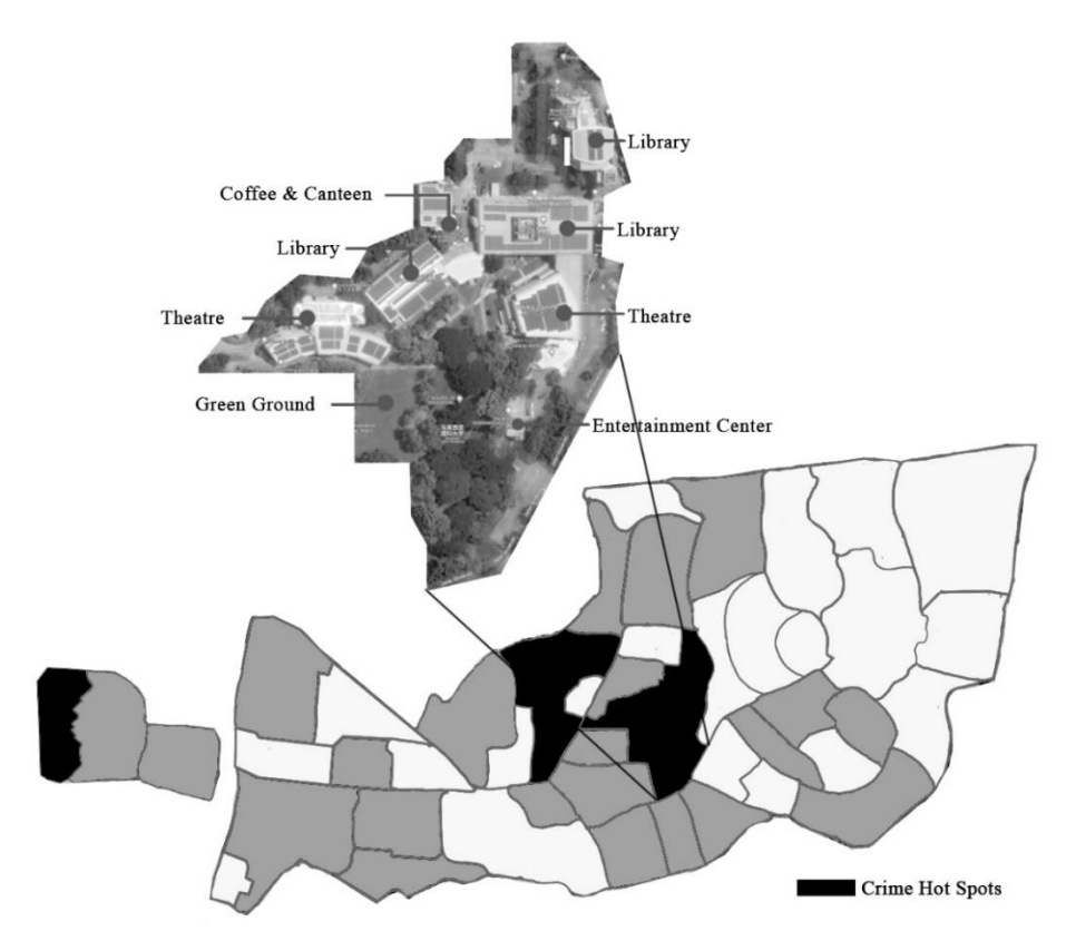
Figure 3: Crime Hot Spots