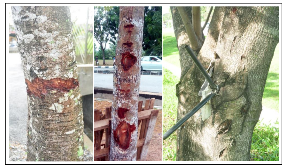
Figure 1: A sample of urban trees that are being vandalised.

Beyond its immediate aesthetic impact, TV has long-term ecological consequences as well as detrimental effects on the health of urban ecosystems. Damaged trees are more prone to diseases, pests, and environmental stressors, which shorten their lifespan and general health (Cavender & Donnelly, 2019). Furthermore, the ecosystem services offered by mature trees, such as temperature regulation, air purification, and wildlife habitat, are disrupted by their disappearance (Amir et al., 2022). Community involvement, public awareness campaigns, and cooperation between local government and environmental organisations are all part of the efforts to combat TV and foster an appreciation for trees and their vital role in maintaining urban environments.