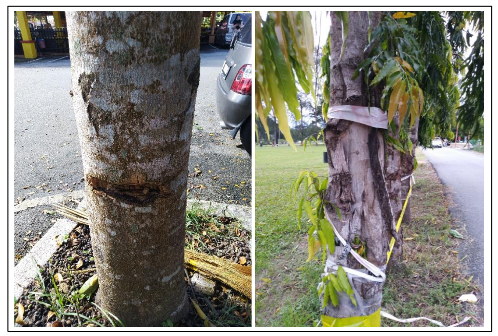
Figure 3: The overgrown and HTs vandalised in the studied area.