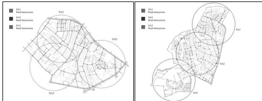
Figure 3: (a) Road intersections of Pulau Tikus, Penang (b) Road intersections of Tanjung Tokong, Penang