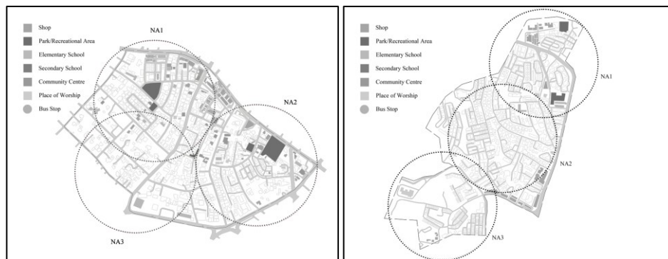
Figure 4: (a) Mixed land use (nonresidential) of Pulau Tikus, Penang (b) Mixed land use (nonresidential) of Tanjung Tokong, Penang