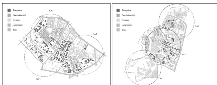
Figure 5: (a) Mixed land use (residential) of Pulau Tikus, Penang (b) Mixed land use (residential) of Tanjung Tokong, Penang