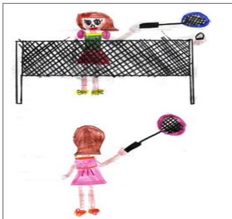
Figure 4: Drawn by GA4

In this research, the two main characteristics that promote a safe and nurturing environment for children to roam around with freedom are positive parents and community support.