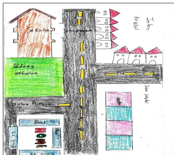
Figure 1: The neighbourhood map as drawn by GA7

The neighbourhood map done by GA4 (Figure 2) shows that a playground was provided in her neighbourhood. She also drew a gate to access the playground, as well as some playing equipment. Based on the map, the researcher asked her about the condition of the playground. In response to that, GA4 explained: