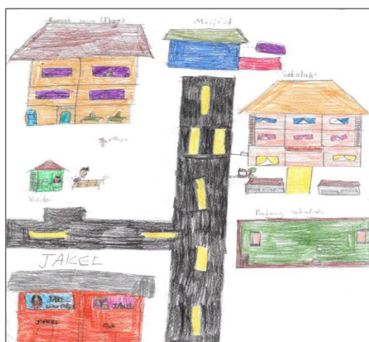
Figure 3: The neighbourhood map as drawn by GA5

In Zone 3, the increasing number of residential, industrial and commercial areas can lead to the loss of open spaces and children are likely to be acutely affected by this. As illustrated in Figure 3, GA5 was staying in an apartment and the apartment was surrounded by a school, a mosque and commercial buildings. She felt that there are no space for nurturing environment within the vicinity of her flat. If she wants to go to the green space, she needs to walk with her parents because crossing the road on her own would be dangerous. She would prefer it very much if the play space or green space is located just below her apartment or that every floor of the flat is provided with one green space for the children.