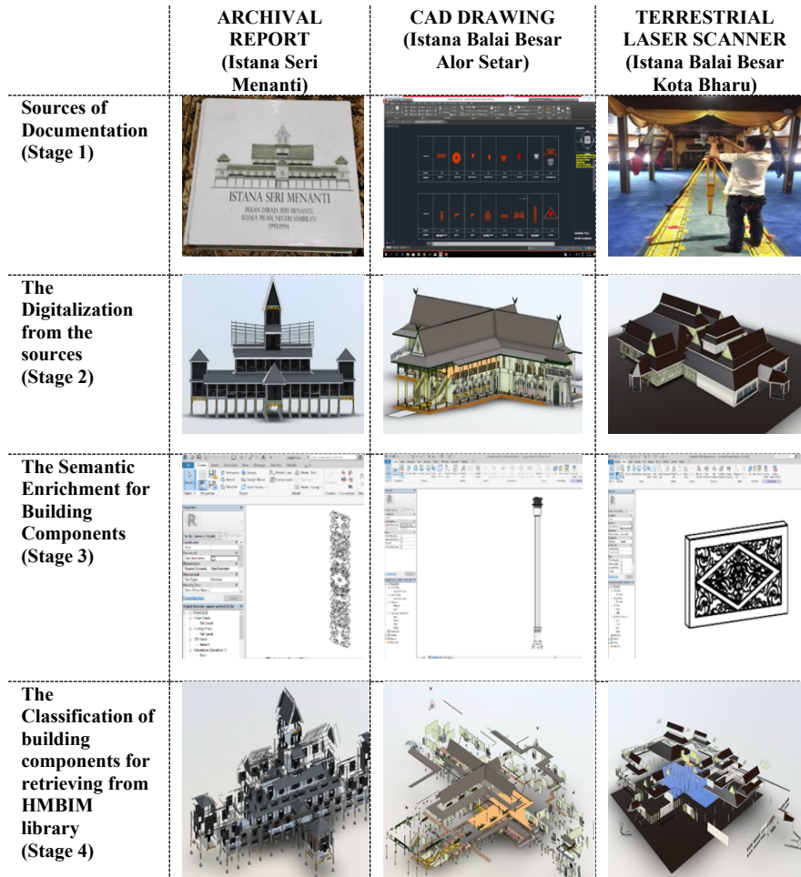
Figure 1: The process and result for BIM digitalization using multiple approaches