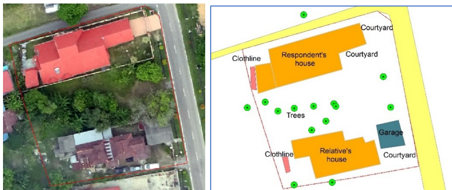
Figure 5: Case study 3

Fig. 4 shows one parcel within the village in Case Study 2. The sketched plan of the house shows a parcel of the respondents' houses. The houses are all located within the same lot of land. The houses are orientated to the main road and just nearby to the relatives' houses. One respondent's family runs a stall in front of their house, which is strategically located by the main road. This finding also shows the value of a strong family relationship in the respective parcel. Many trees can be identified around the compound, particularly those at the back of the house. The material of the courtyard is asphalt. A shared courtyard can be used for collective activities of the family members. At the middle and side of the compound are palm trees, which provide a shaded and cool environment, hence a resting area for the villagers.