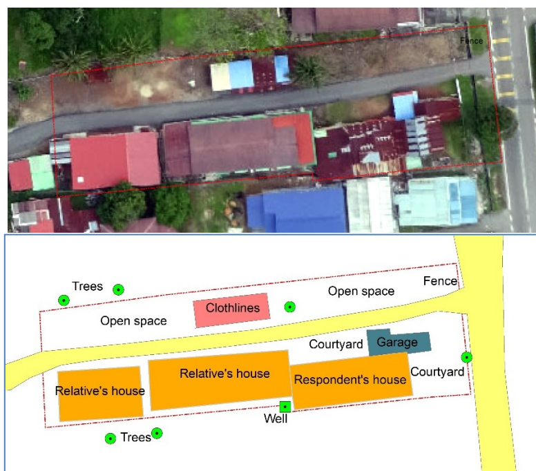
Figure 3: Case study 1

Fig. 3 shows the illustrations for Case Study 1. One of the respondents' houses is located in front of her relatives' houses, which are located within the same lot of the land. The kinsfolks prefer to stay close to each other to assist each other in daily activities if necessary, thus indicating a socio-culture value of a strong relationship, cooperation, and consensus. They are also comfortable living with a family. Such value also reflects the respect among the family members.