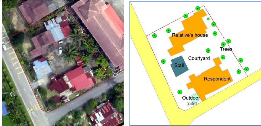
Figure 4: Case study 2

Fig. 4 shows one parcel within the village in Case Study 2. The sketched plan of the house shows a parcel of the respondents' houses. The houses are all located within the same lot of land. The houses are orientated to the main road and just nearby to the relatives' houses. One respondent's family runs a stall in front of their house, which is strategically located by the main road. This finding also shows the value of a strong family relationship in the respective parcel. Many trees can be identified around the compound, particularly those at the back of the house. The material of the courtyard is asphalt. A shared courtyard can be used for collective activities of the family members. At the middle and side of the compound are palm trees, which provide a shaded and cool environment, hence a resting area for the villagers.