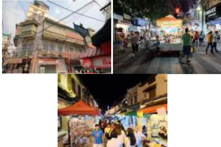
Figure 4: Illustrated the streets scene from cases study, Bangkok (left); Hanoi (middle); Melaka (right)

merchants. Bangkok City with the arrangement of zoning regulation emerged the area for Sino-Siamese resident, which later named as China town. Since 1853 The Chinese settlement in Sampheng had become the bustling market with full of supply for wholesale and retail product. Sampheng as the heart of Chinese community in Bangkok, represent the ideology of commercial area of Siam until today.