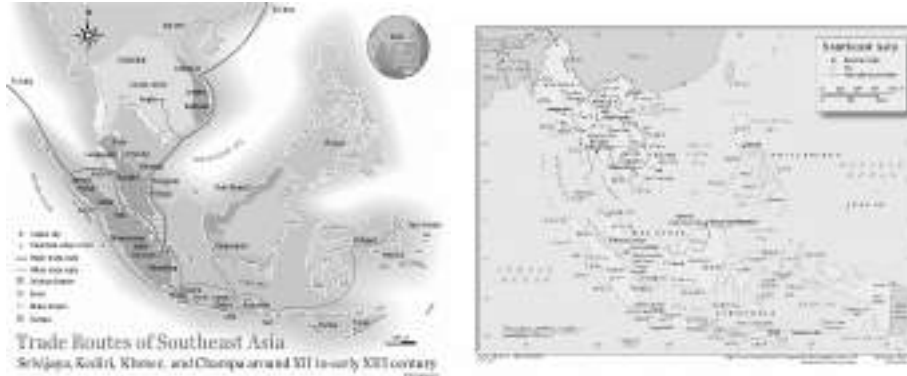
Figure 1: Trade Routes of Southeast Asia circa 11 st – 13 rd (left); Southeast Asia political map as seen today (right)

"...human kind's greatest creation has always been its cities." Kotkin, J. (2006)