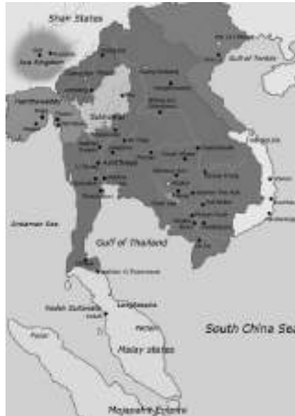
Figure 2: Map of Southeast Asia circa 1400 CE, showing Khmer Empire, Ayutthaya Kingdom, Lan Xang kingdom, Sukhothai kingdom, Champa, Kingdom of Lanna, Dai Viet and surrounding states.